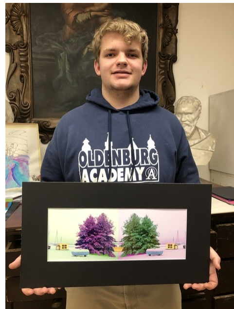
OA Art students donate to the OA Dinner Auction