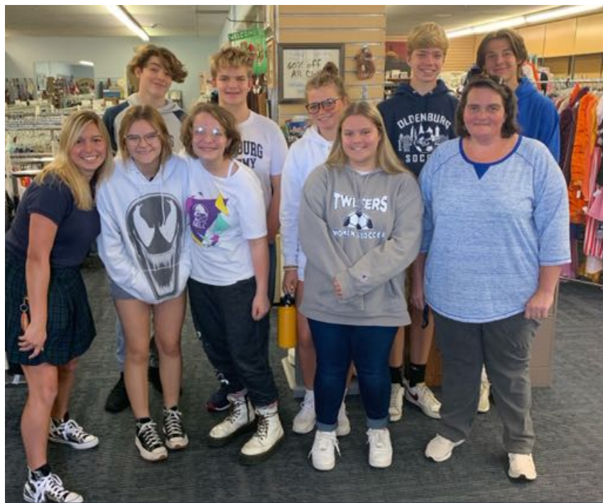
On Thursdays, the sophomores volunteer at Twice Blessed during the Go Beyond Block days, organizing items and helping around the store.