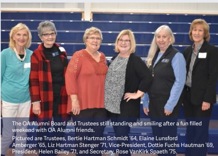
The OA Alumni Board and Trustees still standing and smiling after a fun filled weekend with OA Alumni friends.