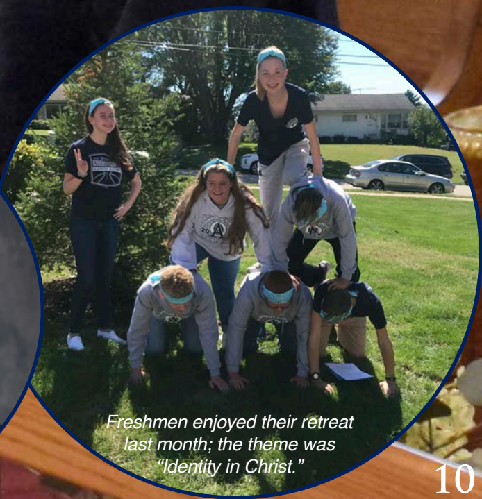
Freshmen enjoyed their retreat last month; the theme was "Identity in Christ."