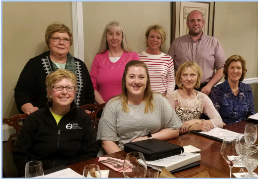
Newly inducted and outgoing members of the OAICAA Board pose for a photos at their first meeting in May.