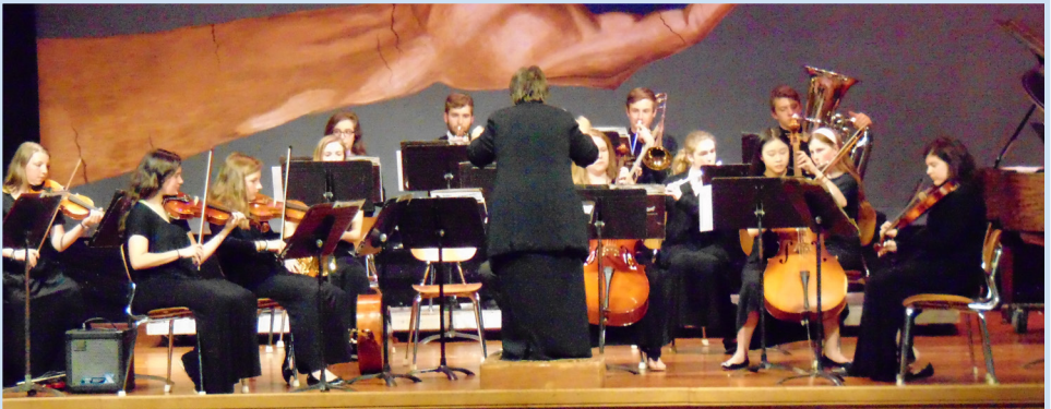
Top to Bottom, Left to Right: Sophomore retreat at Michaela Farms; AP scores recognition; Girls' Tennis wins regionals; May crowning; orchestra playing at Spring Concert - Care of Creation